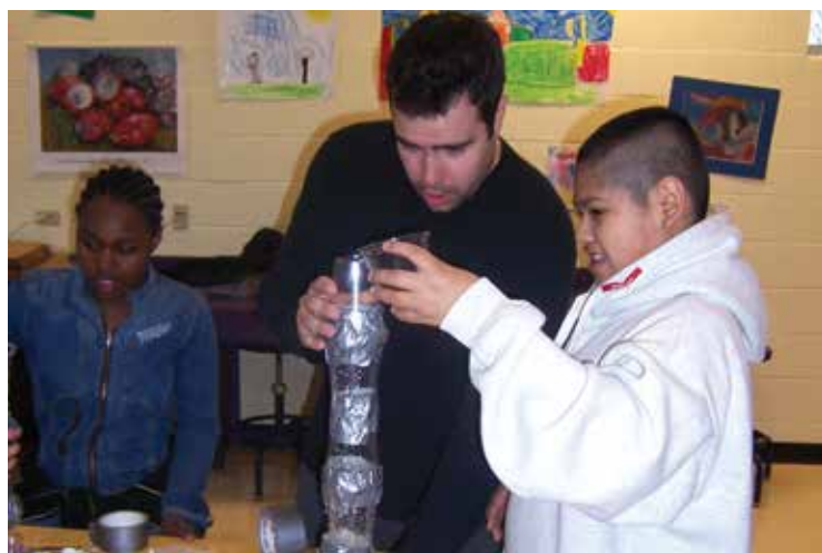
Above: Dane County students experiment and explore science through the SCIENCECountErs after-school program.